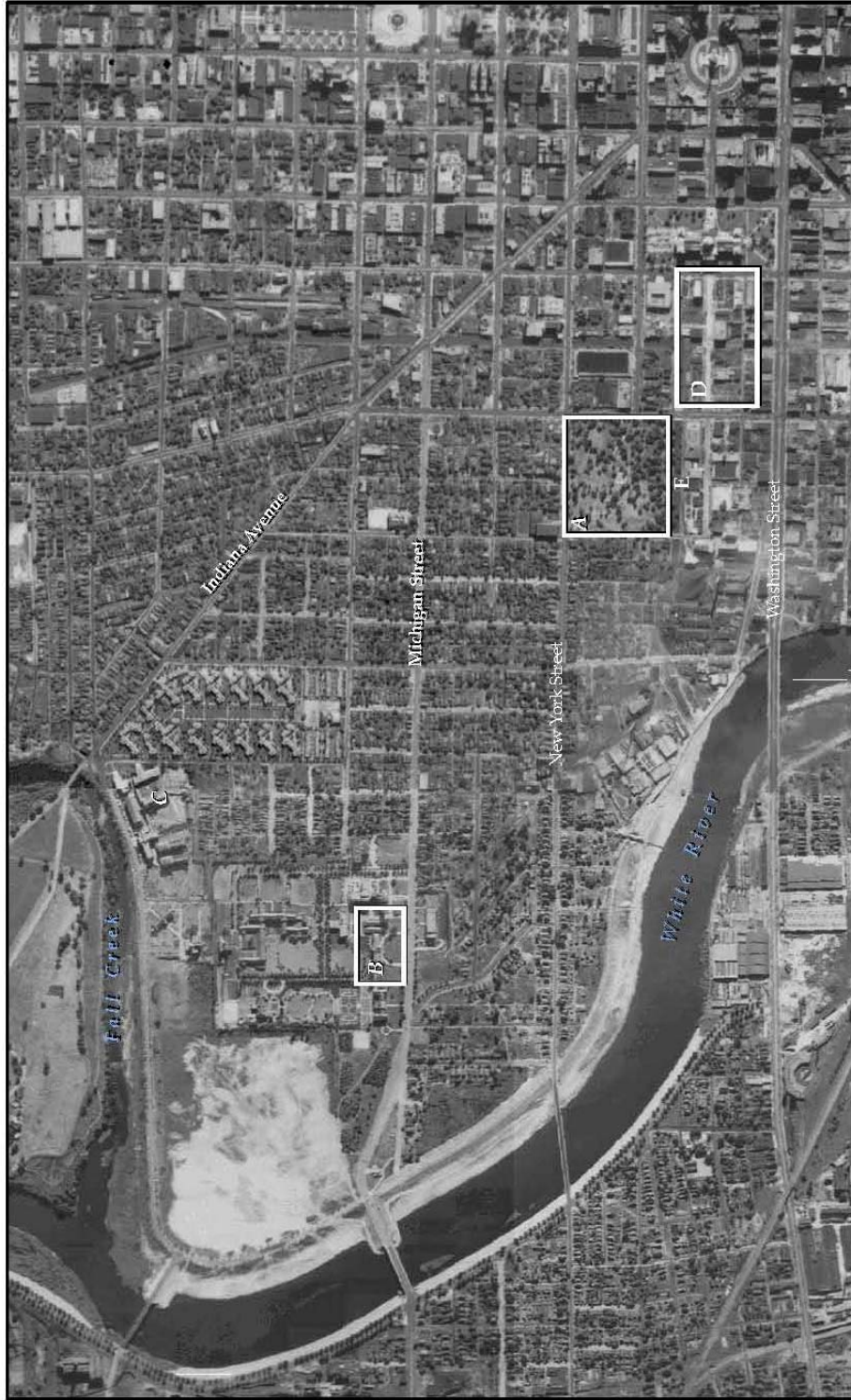
Figure 1. Annotated 1941 aerial photograph illustrates locations that played a role in the location of Robert W. Long Hospital: A) Military Park, B) Robert W. Long Hospital, C) City Hospital (now Wishard Memorial Hospital), D) proposed site of Kessler's Plaza Plan, E) site of Central Canal.