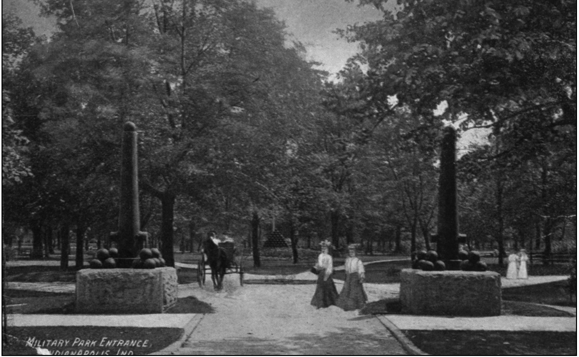
Retired cannons with cannonballs frame the entrance to Military Park and the cannonball monument is visible in the background. Historical postcard in author's possession, c.1910.