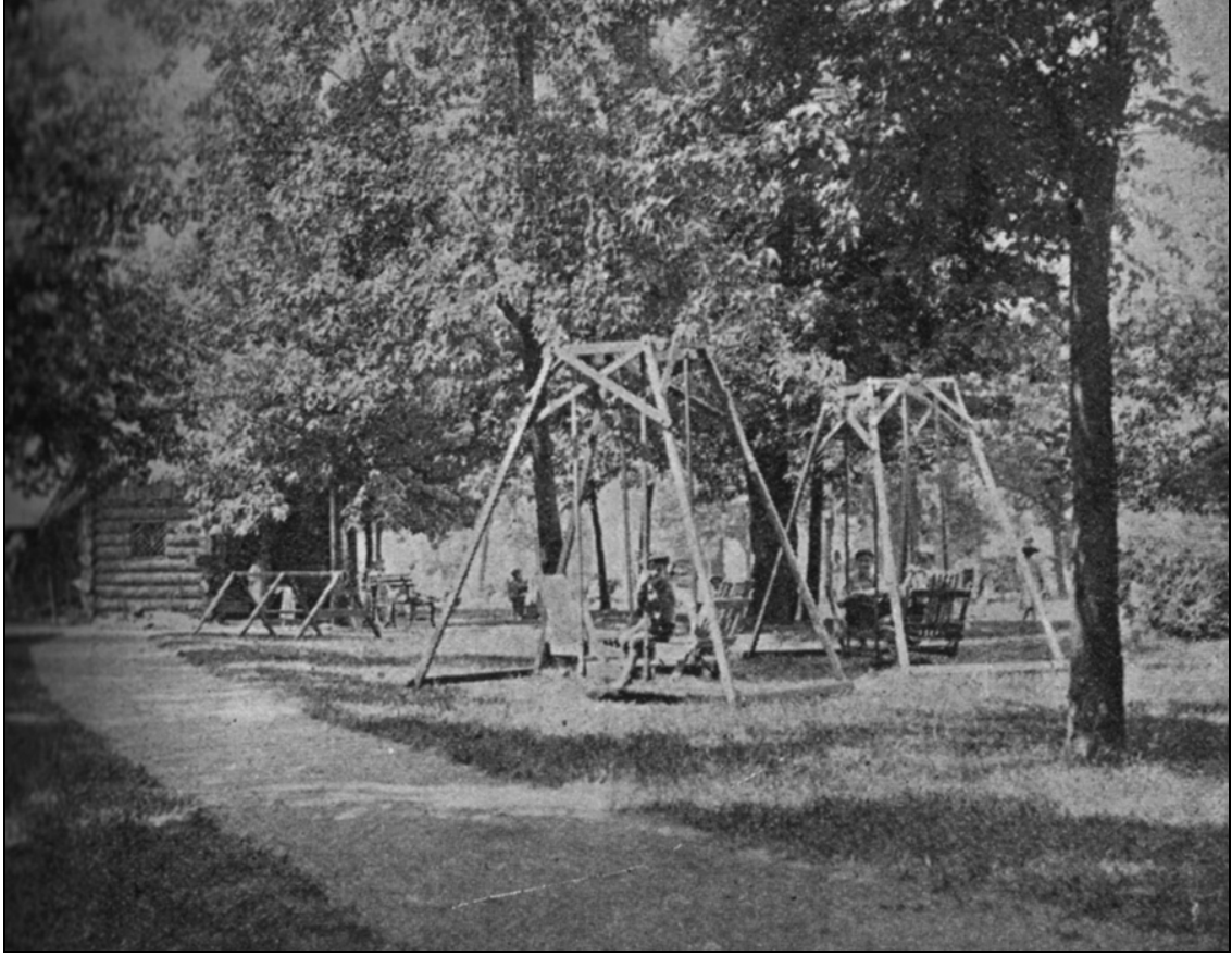
Children play on swings during a summer day in Military Park. Other playground equipment is shown in the background. From: Souvenir, Song Book and Official Programme, Fourth International Convention of the Epworth League in Indianapolis, Ind. , 1899, p. 11.